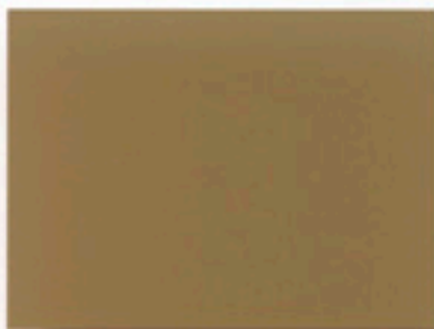
TWF 14712 Sandstone